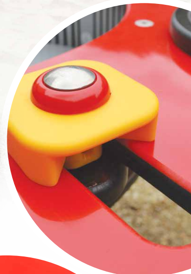
Built-in sand moulds